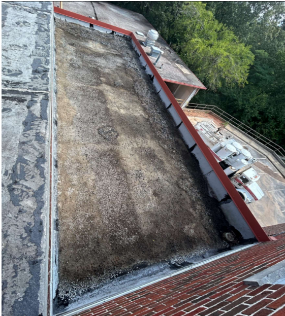
Rock removal on the roof is complete