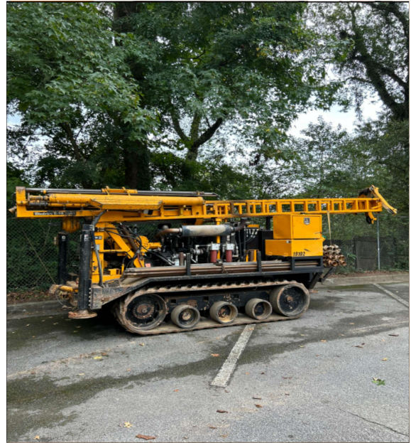
Begin Drilling in the stairwell area in the old auditorium